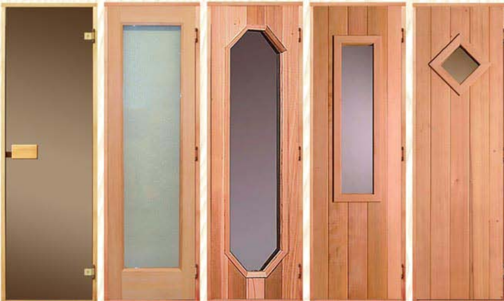
Standard Alder Wood Door DLSES-GD-BR

Rough Opening Sizes: 26" x 74" and 26" x 82" ADA Compliant option 36" wide